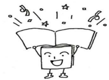
“TSURUPON” the mascot of the Tsurumi Library↑

Parents and children can enjoy reading the children's picture books in foreign languages.